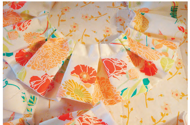
Portion of Ruffle Circle Shown

Step 12. Repeat step 11, thirteen more times, with each pleat measuring \frac{5}{8} " across with a \frac{1}{4} " tuck on each side. The edges of each pleat should butt up against the pleats next to it. The 13th pleat will end back at the seam line.